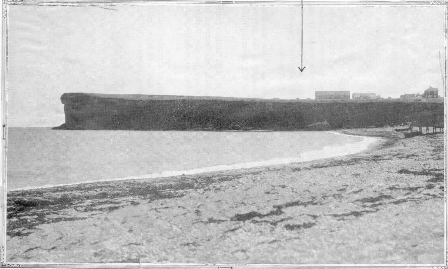
Black cape and beautiful beach at Cap-d'Espoir